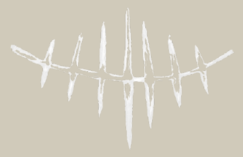
ATELJÉ JOHAN FERNER STRÖM Urban Art Solutions

<u>WWW.JOHANSTROM.COM</u> <u>JOHAN@JOHANSTROM.COM</u> +46 070 777 20 72